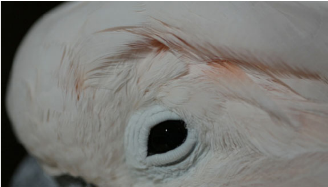
Jennifer Brady, Wow and Flutter , 2013 video, detail of projection installation (part of the Arts Council Collection)