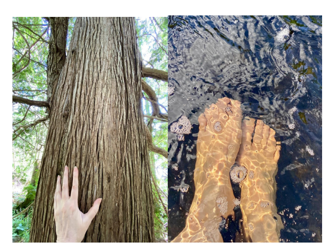
Figure 1. 2D photograph and 2D video still image used during the program.

Programs included three nature connection invitations. The first involved slowing down, opening the senses, and practising a soft gaze. The second was a nature-based guided meditation involving connecting to the atmosphere and qualities of, for example, a beach or mountain. The third invitation supported a deeper connection with nature through, for example, an offering and receiving of metta (loving kindness) to and from a tree. The nature videos, drawing upon research on sensory engagement with nature [58], included images and short video clips from the EcoWisdom Forest Preserve incorporating the colours blue and green, fractal patterns, and sounds of water, wind, and birds. They also drew upon neuroscience by including video/images of hands on bark or feet in moss to elicit the activation of mirror neurons in participants. Figure 1 provides examples of 2D hand on tree images and of 2D video of feet in flowing water used during the program to facilitate mirroring. Activation of mirror neurons occurs when a person observes someone else engaging in a movement (e.g., stroking moss), and the same sets of neurons are activated in the brain of the observer [59]. This was done consciously to support the engagement of people who may experience significant mobility impairments or paralysis.