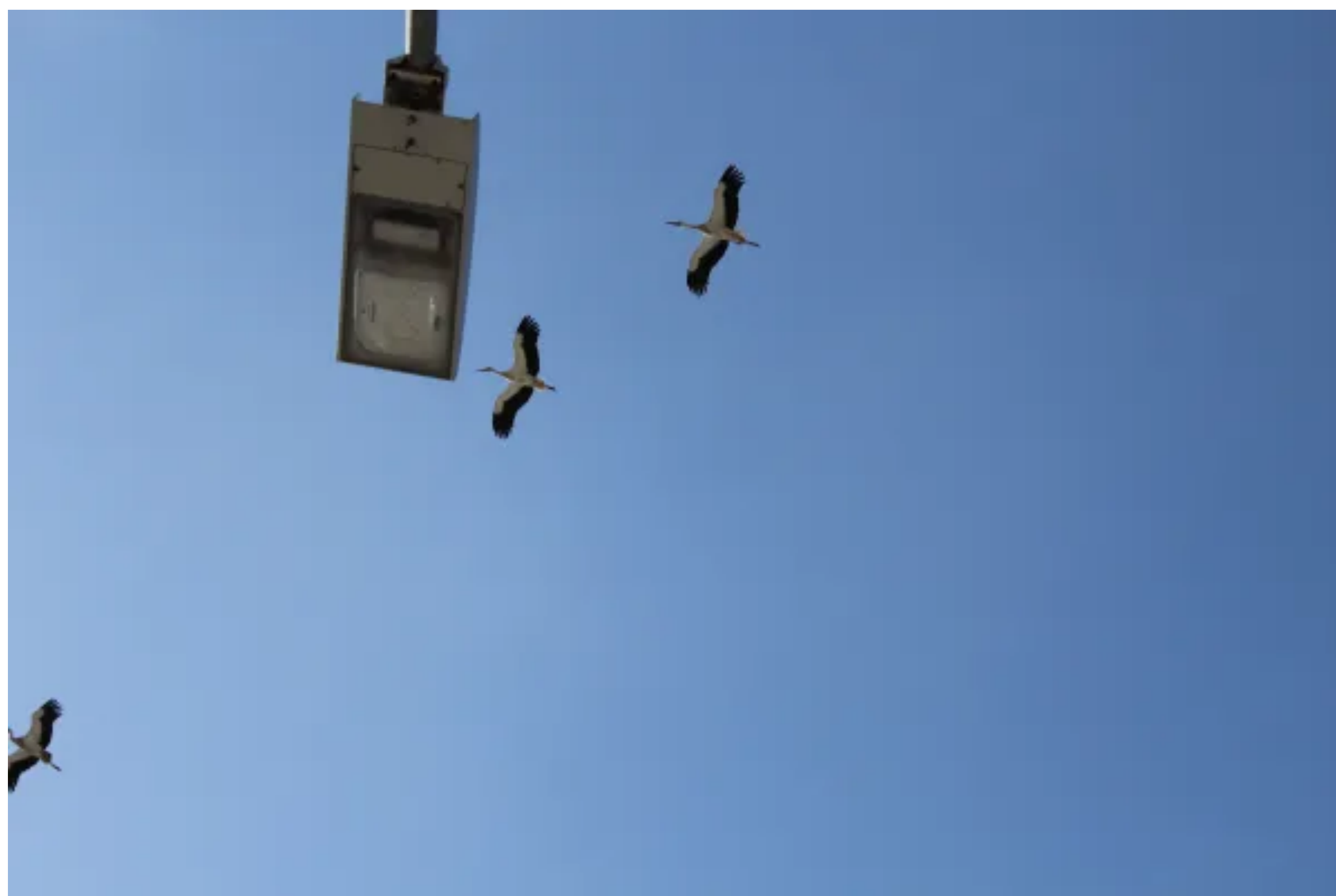
Baker Storks Outside the Jupiter Hotel II, Photograph, 2019