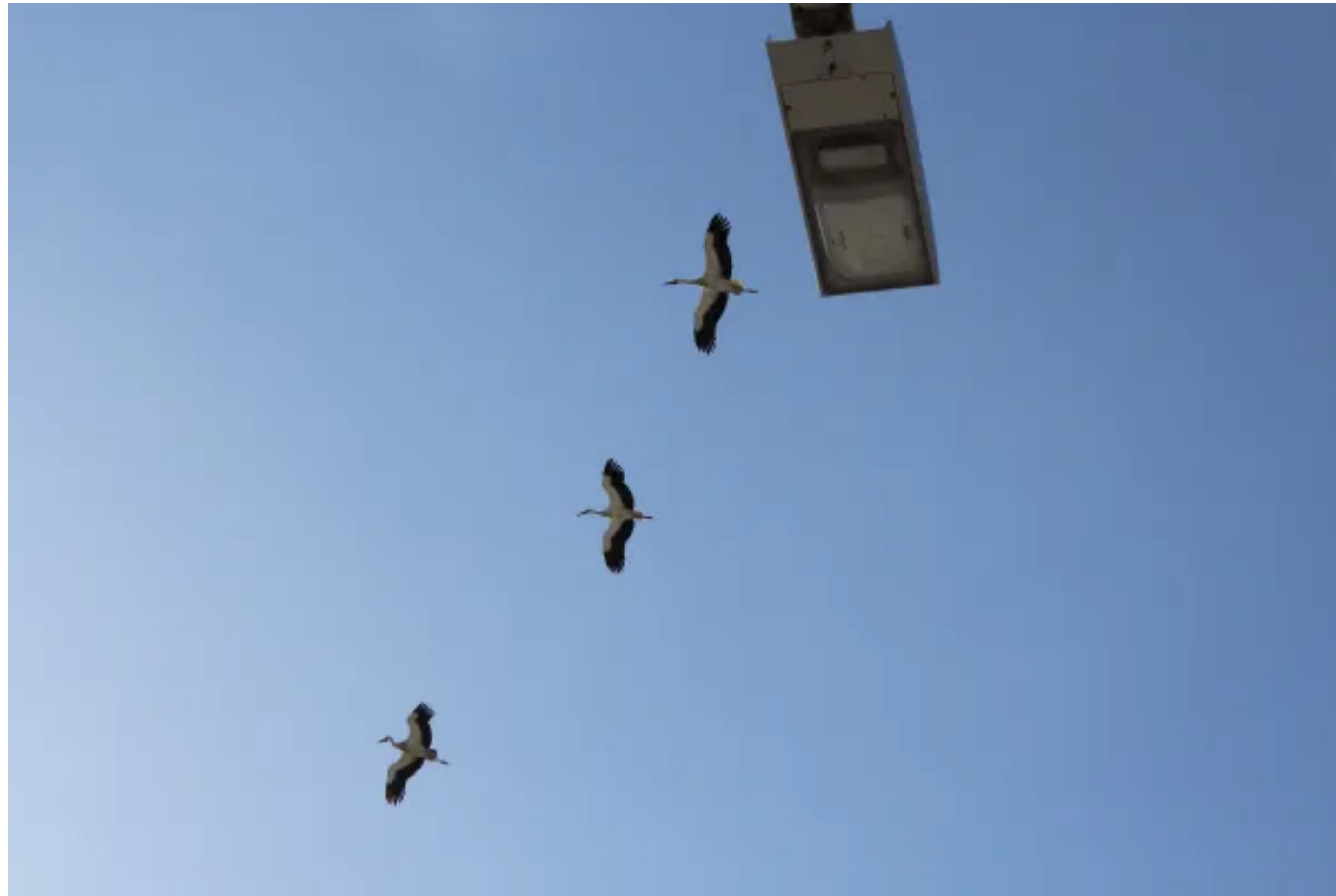
Baker Storks Outside the Jupiter Hotel I, Photograph, 2019