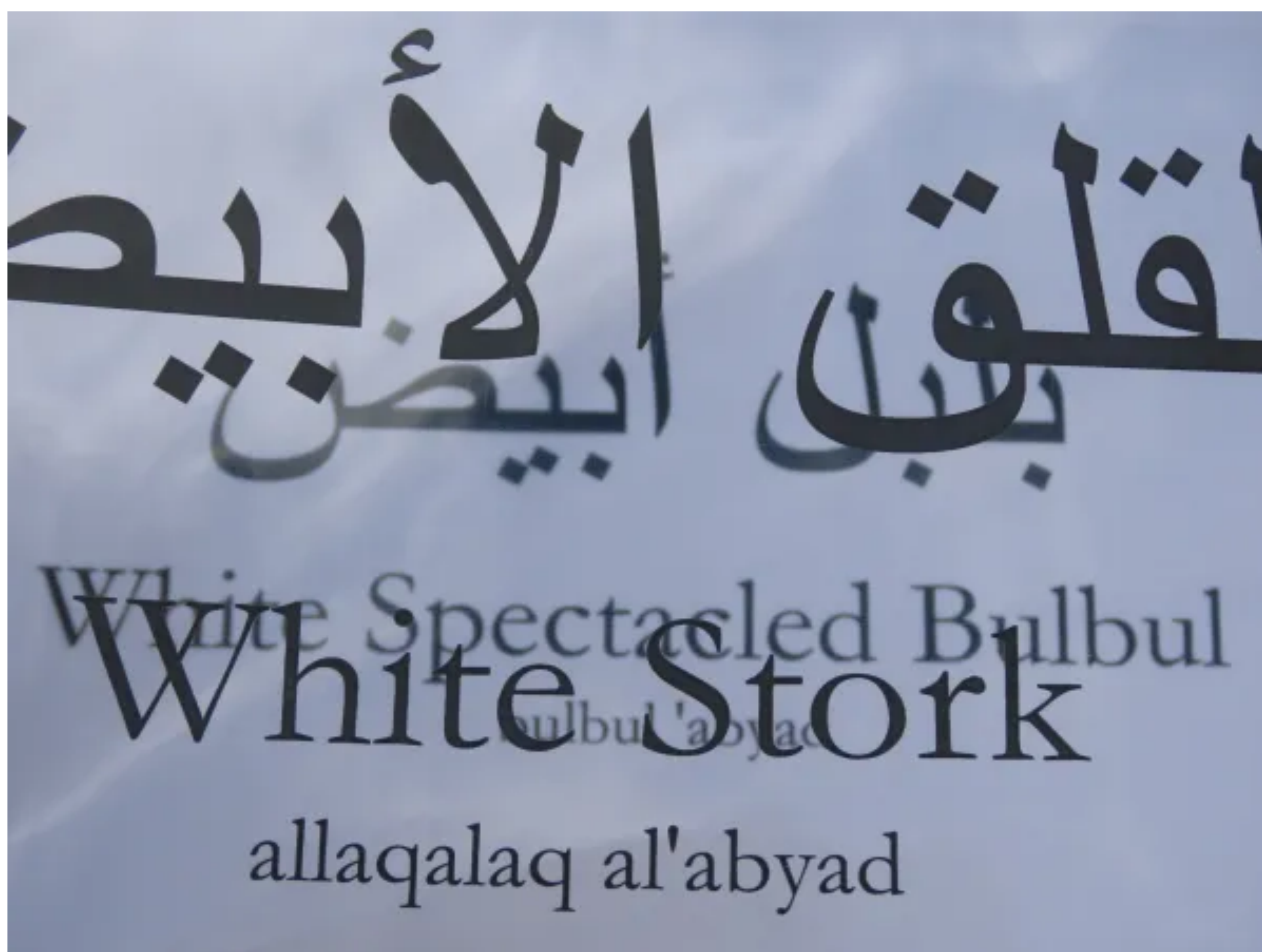
Clover White Stork, Amman 01, Mixed media photograph, 2023