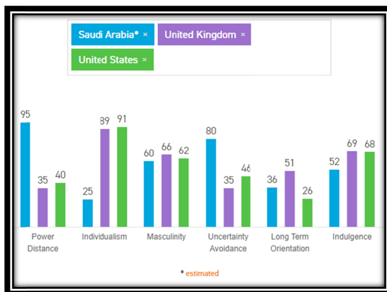
Figure 3. Hofstede's insights cultural dimensions 2020