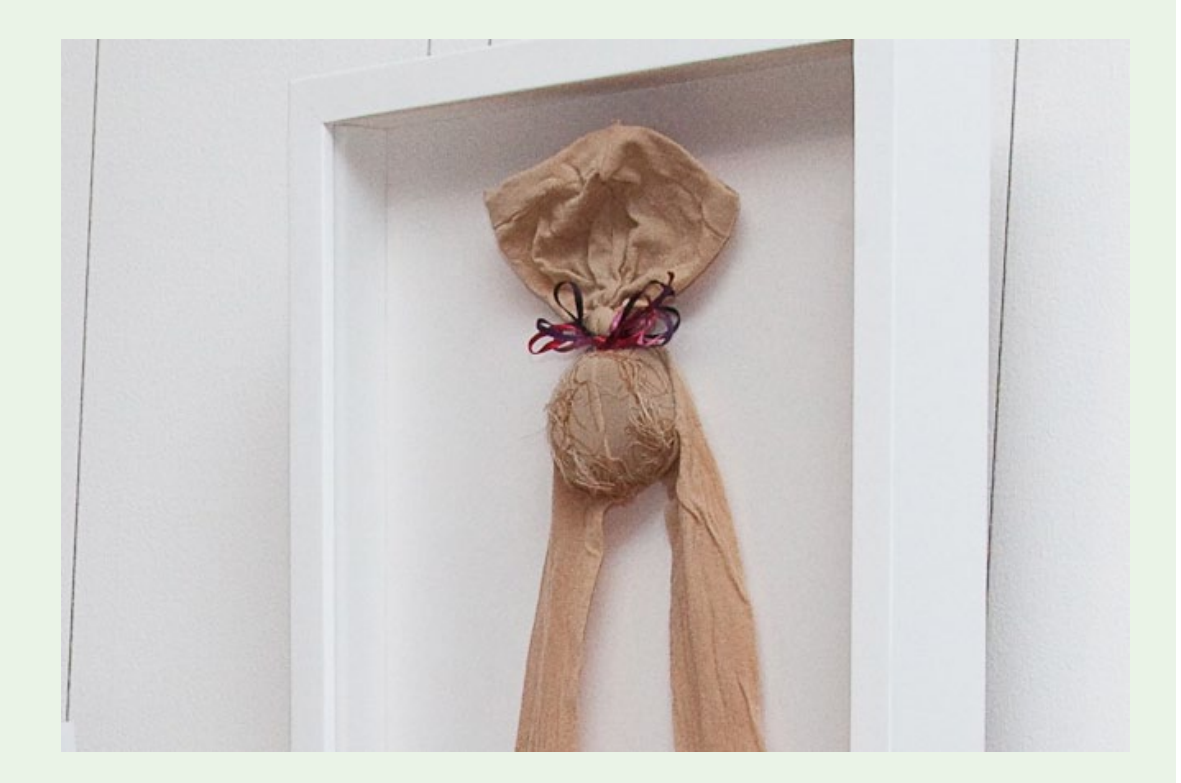
Fig. 3. Balding Pubis: Sculptural work.

The facilitator had a background in running support groups for pregnant women and new mothers, to enable them to explore their changed sense of self-identity and sexuality as a result of motherhood (Hogan 2003; 2012). Although the groups started from an exploration of personal experience, they also critiqued and challenged iatrogenic aspects of the hospital regimes (that is, those medical and institutional practices and norms which are counter-productive and oppressive, though often well-established). As such, this is art as social action and critique, which moves beyond a narrow focus on individual psychopathology, though arts therapists are trained to 'hold' intense and difficult material and personal distress which may arise, and are skilled in managing inter-personal conflict. If art elicitation groups intend to delve deep into difficult subject-matter, there is a strong case to be made that a highly-skilled art therapy practitioner is employed for this work, as artists may quickly find themselves out of their depth (Hogan & Pink 2012). Trained art therapists also have a good understanding of ethical issues, which can be useful in working in multifaceted situations.