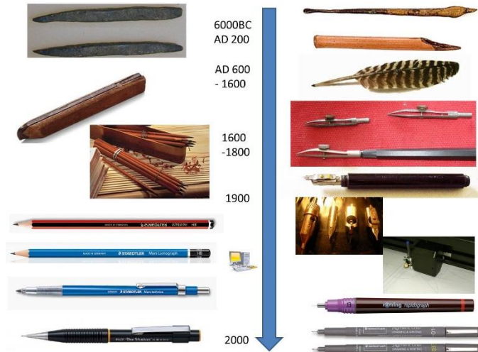
Figure 2: History of drawing tools.