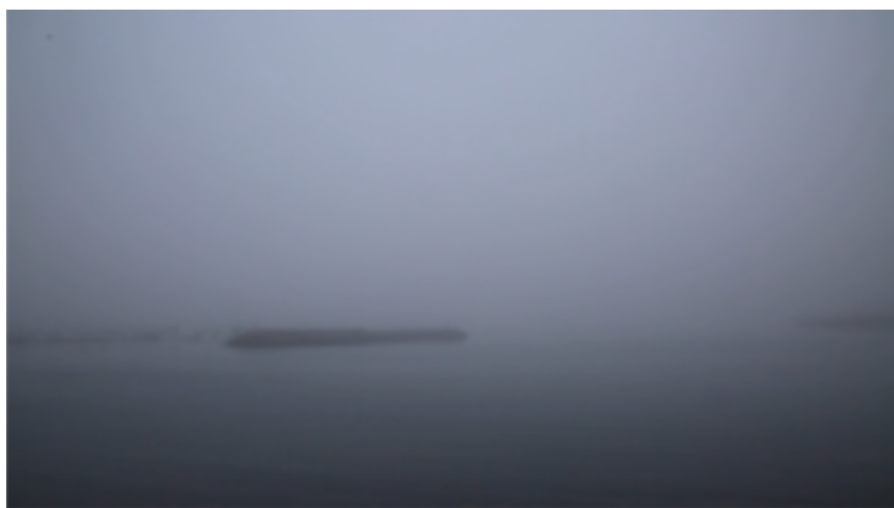
Watchtower: Video/Audio – duration 4:48m (Link to video on conference Vimeo site)

Watchtower is a new work from Bryndís Snæbjörnsdóttir and Mark Wilson's award-winning art project Vísitation (2019-22). It examined polar bear landings around the coast of Iceland over the last 150 years. Included : Although it is clear such bears were present in Iceland for tens of millennia before humans first settled there during the late 9 th Century, historically and to this day, when they do arrive (and are noticed), they are pursued as unwelcome migrants and shot.