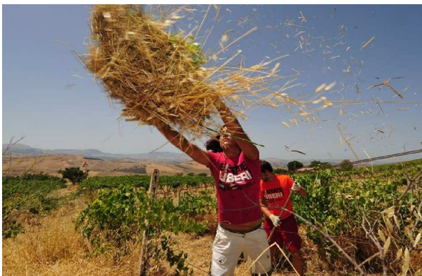
Fig. 3 The activists of Libera working on the confiscated lands in the summer with t-shirts that state “Estate Liberi” (translated “Free Summer”)

The idealization of their struggle, reference to the regional patterns, policies to cooperate with local people and civil society are echoed profoundly through the works of Libera Terra and its cooperative institutions. Therefore, not only the confiscated lands on which they work to realize their ideals but also the crops, fruits and vegetables that they gather from these fields turn to the idealized icons when these products find a place in the supermarkets or dining tables of the Italian citizens. More strikingly, these products are stamped and marked with the logos of Libera Terra, which utter anti-Mafia slogans at the