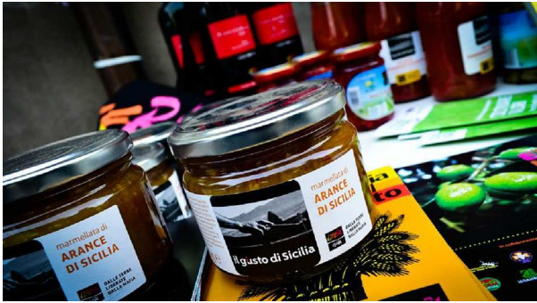
Fig. 4 The marmalade that was produced from the confiscated lands displays an anti-Mafia slogan and wordplay on these iconic figures, as shown in the photo— il g(i)usto di Sicilia —the taste (justice) of Sicily. This product can be purchased in the markets and events of Libera Terra

same time. For instance, one may encounter one of these products in a supermarket and may read the slogan Il g(i)usto del legume ( il gusto means the taste or flavor and il giusto is justice) on the cover of a bottled vegetable. One may observe similar slogans and etiquettes on nearly every product of Libera Terra and its cooperative institutions (see Fig. 4).