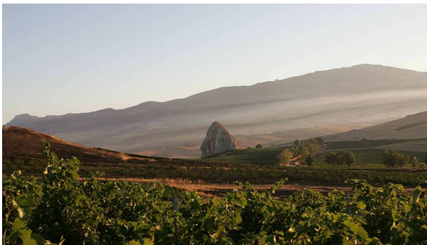
Fig. 2 A confiscated vineyard in Sicily, which reflects the idealisation and beauty of a landscape through the works of Libera Terra. The organisation uses various landscapes photographs with the products on these lands to mobilise more people and to take more public attention

“The products marked with “Libera Terra”, with their gusto of legality and responsibility, arrive to the houses and tables of the numerous Italians, and perhaps