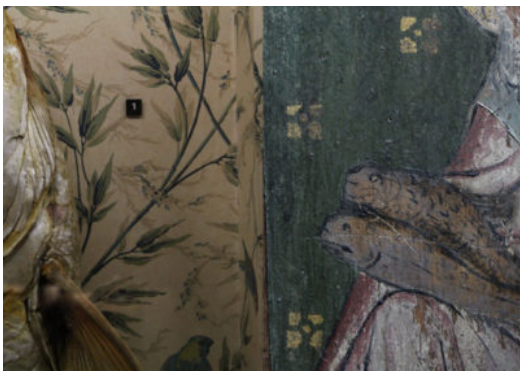
Scapeland XII, 2014 Constructed photograph, 16 x 48 in.