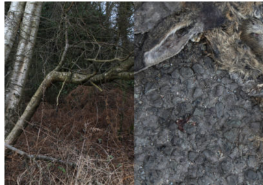
Scapeland XXIV, 2015 Constructed photograph, 16 x 48 in.