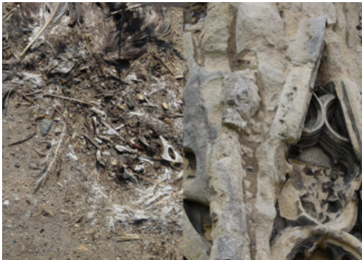
Scapeland VII, 2013, Constructed photograph, 16 x 48 in.

on its quiet country lanes. The photographic juxtapositions within each piece in the series are constructed on the basis of some sort of visual “fit.” Sometimes there is a rhythmic continuity across the pairings; sometimes a kind of beauty. Some of the pieces happen to record the look of particular animals’ unnecessarily lost lives, and they do so with an awareness of other artists’ handling of similar subjects, but the series is concerned neither with narrative nor with commentary. Jean-François Lyotard used the term dépaysement to characterize the inescapable otherness that he saw as “a precondition for landscape.” The aim of the Scapeland series is to present something characteristic of this particular landscape simply by registering the material continuity of feathers, flint, earth, guts, leaves and stone.