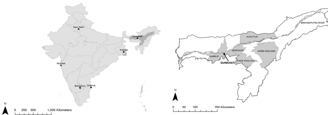
Fig. 1. a) Map of India with the state of Assam highlighted in dark grey b) map of Assam showing the Brahmaputra river and the districts included in this study adapted from [102].