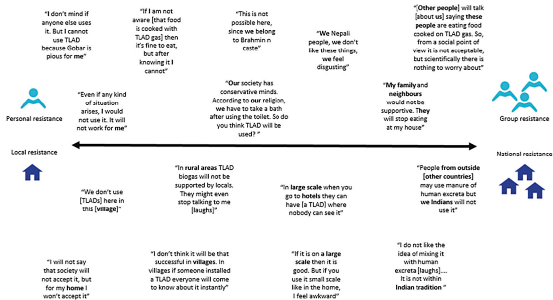
Fig. 2. Participant quotes around socio-cultural rejection towards toilet-linked anaerobic digesters arranged on a scale that highlights the difference between personal and local resistance compared to group or national resistance.

in their village or villages in general and 3) resistance due to national place identity and feelings that TLADs are not within Indian behaviours or values. Fig. 2 contextualises this analysis by placing participant narratives on a scale between personal and local resistance to group and national resistance, respectively. Identity can be a strong motivating factor for why people reject technologies and practices [55,56], such as rejection of toilets in preference for OD [60]. Identities that translate into beliefs that TLADs do not belong to certain places or people will have strong implications for dissemination. Biogas programmes might have more success disseminating TLADs if they work with communities to renegotiate personal and place-based identities around what is seen as waste and what has value more broadly [60,113], rather than narrowly addressing only TLADs.