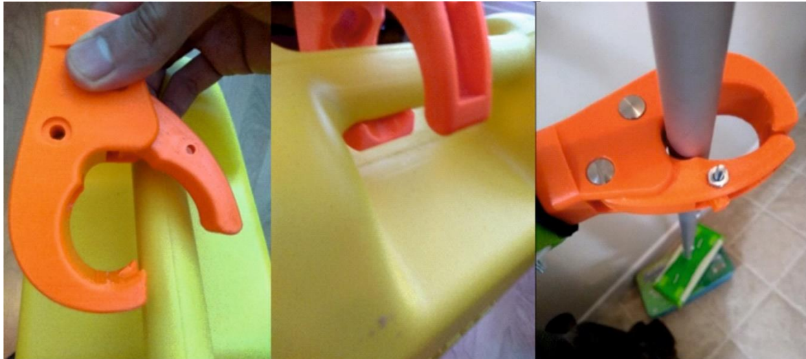
Figure 8: Inner profiles provide the shape to lock around handles for controlled manipulation. Other ADLs (e.g. gardening) involve making use of the inner profiles, but need testing in the field to ensure grip and balance can be maintained when imparting an impact force (swinging a shovel/garden hoe).