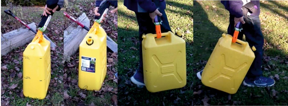
Figure 14: The prehensor is used to lift a load of 12.9 kg. As the arm swings in the first few steps, the prehensor moves to a stable position towards the rear of the handle.

grasp around the handle and lift the jerry can. It was then carried at a comfortable walking pace for approximately one minute Figure 14. It was noticed that in the first few steps, as the arm and jerry can swung, the prehensor shifted to the back of the handle as this was the most stable position. There was no further shifting of the prehensor relative to the handle afterwards which is likely do to the position internally where the water line was level.