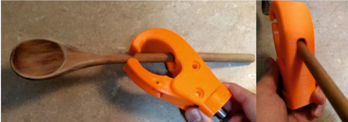
Figure 10: The handle of the wooden spoon is pushed through the passthrough hole in the fixed jaw. The fixed jaw and thumb tip provide the force to secure the grip.

A passthrough hole was added within the Matoke nook to allow the prehensor to hold utensils or long thin-handled tools (as shown in Figure 10 ).