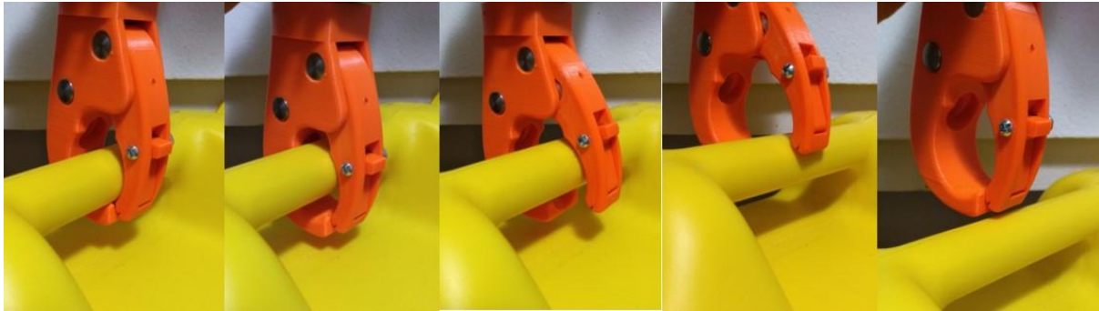
Figure 4: Pull-off is achieved by moving the handle out of the prehensor's hook area and pushing against the thumb from the inside to create the opening force.

The second mode of operation involves a lever, herein referred to as a 'trigger lever', concealed inside the mobile jaw. This novel design for operation requires the user to reach over with their opposite side and push down on a small, exposed section of the trigger lever to rotate the entire body out of the thumb cavity. The trigger lever has a rotation of approximately 60 degrees, after which point it encounters a hard stop and any further force causes the thumb to rotate around its pivot within the fixed jaw (Figure 5).