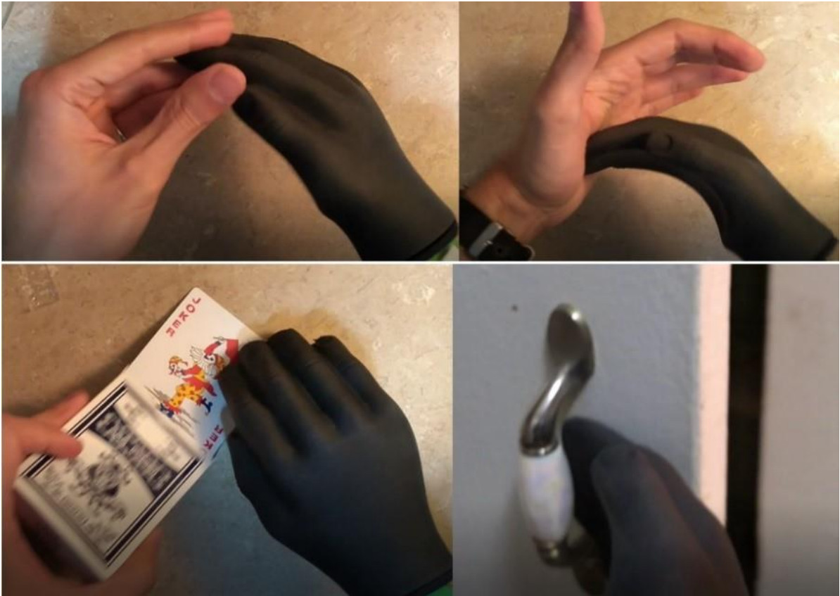
Figure 11: Passive hand being tested for flexibility, friction, and opening a cabinet using the handle.

Initial testing of the passive hand (which now included a standard \frac{1}{2} -20 bolt for socket attachment) proved to be successful and it is now being printed locally in Uganda. The flexibility may require fine tuning some of the print parameters (speed, infill percentage) but these can now be performed at Makerere University.