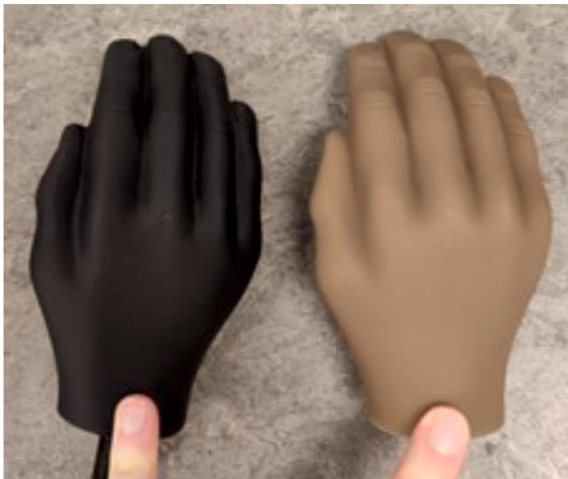
Figure 3: The commercial terminal device (tan colour) and the 3D printed device (black) The passive hand required approximately 40 hours to print. This 3D printed hand did not include a ½-20 threaded bolt for mounting to a prosthetic arm but served the purpose of Co-design2.

One of these hands was then scanned using an EinScan Pro+ 3D scanner 2 and the resulting file was imported into the CAD software. The imported model was then processed to ensure that any voids in the scanning process are patched, before exporting the file to the 3D printer. The hand was printed upright on the printer bed (i.e. lowest layer is the wrist end) with a Prusa i3 MK2S 3 located at the University of Portsmouth. The main structure had 40% infill, print speed between 15-20 mm/s, and layer height of 0.2mm. The flexible filament chosen was Ninjatek Chinchilla 4 . This is a thermoplastic elastomer (TPE) material with a Shore hardness of 75A, a matte finish, and resulted in a passive hand that could very closely mimic the flexible nature of the commercial terminal device it was modelled after. The local research group at Makerere University also have a similar printer (MK3S). This ensured that the passive device could be produced in multiple centres within the target country and that future updates of passive devices could be designed globally but produced locally which could reduce delivery times. The commercial device and the 3D printed hand are shown in (Figure3).