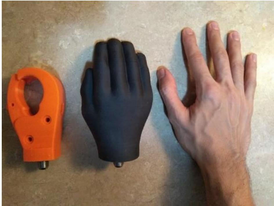
Figure 15: From left to right: prehensor, passive hand, adult male hand.

The final weight of the passive hand and prehensor prototypes were 200g and 155g respectively. This is inclusive of all the internal hardware in addition to the 3D printed parts.