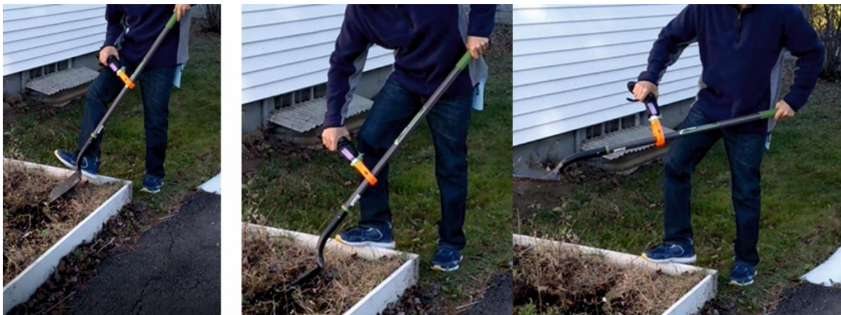
Figure 13: Use of a garden shovel begins with an impact force (foot used to drive shovel into ground), proceeds to a lever action (prehensor is the fulcrum) and then a final lifting force. A lack of secure grip on the handle causes the prehensor to move to different location on the handle which creates uncertainty for the user.

It was noticed that impact forces from long-handled garden equipment could not be transferred to the prehensor as it experienced varying degrees of gripping ability. A garden rake being used to move light weight leaves did not pose a problem. A garden shovel used to lift heavier loads caused the prehensor to slide along the handle during the task especially on impact with the soil. Figure 13 presents this ADL. The lack of a secure grip on the handle results in a loss of control by the user, making it difficult to manage the task. This also meant that impact forces could not be assessed in any meaningful way.