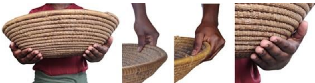
Figure 2: Grasping a Kibbo basket with an overhand or underhand grip or supported from beneath. Any one of the four terminal devices presented in the co-design activity can achieve at least one of these configurations.

The next stage was to describe a series of six Activities of Daily Living (ADLs) that were based on the results of an earlier scoping survey [ 82019L.Kenney et al.L.Kenney, R.Ssekitoleko, A.Chadwell, Ackers, M.Donovan-Hall, D.Morgado-Ramirez, C.Holloway, P.Graham, A.Cockroft, B.Deere, S.McCormack, S.Akram, G.Henry, and K.Giggs ]. The tasks were chosen as they were very common activities (in Uganda) and focused the participants on the ways they might grip the target object. For example, a woven basket (called a Kibbo) could be gripped in over hand, under hand or supported from below and the users could see themselves using one or more ways (Figure 2).