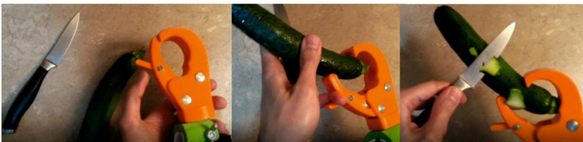
Figure 9: Inserting a fruit into the Matoke nook for facilitating peeling.

Matoke is a green fruit, indigenous to southwest Uganda, and a staple of the country's cuisine. Though similar to a Plantain, a Matoke needs to be firmly gripped and peeled with a knife or machete. Any cylindrical fruit or vegetable is often peeled by holding it within the terminal device, peeling a section, releasing and rotating the fruit, and peeling another section. The task is made difficult because there is limited regulation possible by the user of the gripping force which would provide the counter force to the peeling direction when the knife is drawn towards the body. Creating a counter force is necessary for stability during peeling. For this reason, a cylindrical depression was designed into the fixed jaw where the end of the fruit can rest, holding it stable when peeling. This is referred to as the 'Matoke nook'. For added stability, the thickness of the jaws can be increased, but this is at the expense of less of the fruit being exposed for peeling. When a user is trained to do this task, they will be instructed to expose the trigger lever, then pick up the knife and fruit with their opposite side, in this order. Using their smallest finger, they can then pull down on the lever and insert the fruit into the nook and release and proceed to peel. This ADL is illustrated below in Figure 9 using a Zucchini.