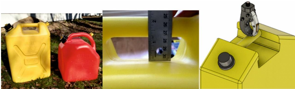
Figure 7: The taller 20L yellow jerry has a smaller handle opening than the red jerry can and was used to determine dimensions for the inner profile of prehensor.

Fetching water using a 20L military-style diesel jerry can (taller than it is wide) is very common in Uganda. Though many different styles and shapes exist around the world, the F4P team used one that resembled the handle area of the Ugandan varieties as closely as possible. This handle opening is narrower and has less space to manoeuvre the end of the prehensor into the opening. There is also a limited space underneath the device before the top of the main body. This is important to note, as when using the push-on functionality to open the prehensor, there is a forward distance that is travelled by the hooked area before the handle enters the interior. Figure 7 shows the jerry can used as the model for design.