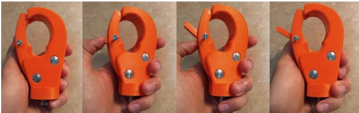
Figure 5: Trigger lever is concealed inside thumb and is rotated outward when needed for opening the terminal device.

The second mode of operation involves a lever, herein referred to as a 'trigger lever', concealed inside the mobile jaw. This novel design for operation requires the user to reach over with their opposite side and push down on a small, exposed section of the trigger lever to rotate the entire body out of the thumb cavity. The trigger lever has a rotation of approximately 60 degrees, after which point it encounters a hard stop and any further force causes the thumb to rotate around its pivot within the fixed jaw (Figure 5).