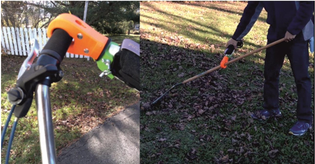
Figure 12: Bicycle handle with rubber grip provides secure hold for prehensor. Long smooth handled garden equipment result in varying degrees of gripping success. A garden rake is easy to manoeuvre because it does not have to carry a heavy load, providing the user with a greater sense of control.

It was noticed that impact forces from long-handled garden equipment could not be transferred to the prehensor as it experienced varying degrees of gripping ability. A garden rake being used to move light weight leaves did not pose a problem. A garden shovel used to lift heavier loads caused the prehensor to slide along the handle during the task especially on impact with the soil. Figure 13 presents this ADL. The lack of a secure grip on the handle results in a loss of control by the user, making it difficult to manage the task. This also meant that impact forces could not be assessed in any meaningful way.