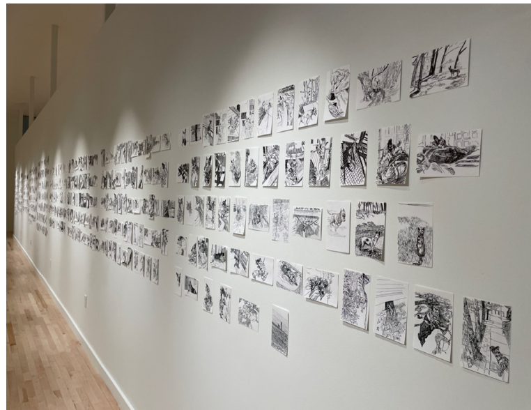
Figure 12. Quarantine Drawings , in the Draw | Breath | Animal exhibition, Tippetts and Eccles Galleries, 2021.

Author Contributions: Both authors contributed equally. All authors have read and agreed to the published version of the manuscript.