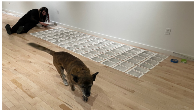
Figure 9. Installing 366:366 (Finally) , with Elvira, in the Draw | Breath | Animal exhibition, Tippetts and Eccles Galleries, 2021.

In Draw | Breath | Animal , the two videos were exhibited respectively at the eye level of horses as a wall projection (Deigaard's artwork) and on the floor where dogs (Bartram's artwork) could freely look. Deigaard's companion dog joined the collaboration in the gallery for this exhibition, aligning herself (along the upturned monitor) during their joint lecture as well as with the artists, and roamed freely within the space during installation of all the artworks included. In the gallery, their large-scale projects 366: 366 (Finally) and Quarantine Drawings were installed simultaneously along a long, fixed wall, a central spine dividing the gallery through its centre. Each could not see the other, but they worked in rhythm to enmesh as collaborators, only as far apart as the depth of the wall and without speaking to the other. Installation, too, was a test of endurance and devotion; the dividing exhibition wall was fifty feet long, and each artist hung hundreds of sheets of images simultaneously over a continual seventeen-hour installation period. Throughout the installation, Elvira was activating the process; she was encountering the work in the space as audience, as participant, as subject matter, protagonist, and muse. (Figures 9 and 10).