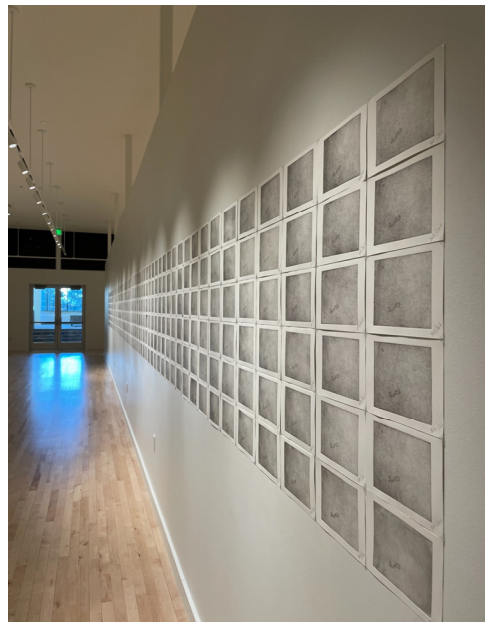
Figure 7. 366:366 (Finally), in the Draw | Breath | Animal exhibition, Tippetts and Eccles Galleries, 2021.