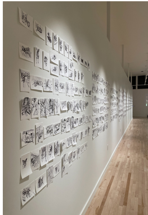
Figure 8. Quarantine Drawings, in the Draw | Breath | Animal exhibition, Tippett and Eccles Galleries, 2021.