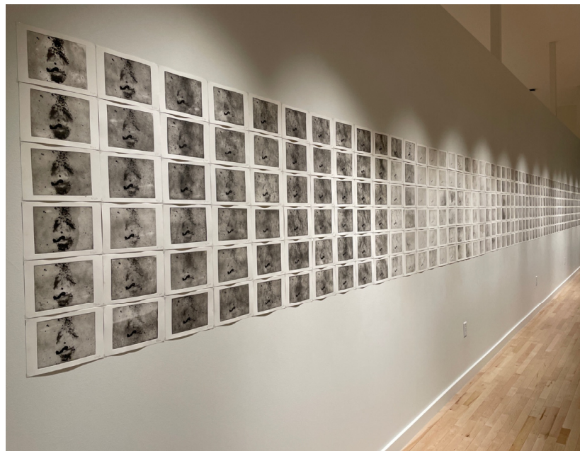
Figure 11. 366:366 (Finally), in the Draw | Breath | Animal exhibition, Tippetts and Eccles Galleries, 2021.