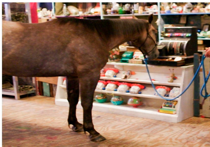
Figure 6. Gus and Deuce Go Elsewhere , supplementary project documentation, Elsewhere Museum, Greensboro, NC, 2014.

The context of the site is important in both artworks. Had either happened in a park or a field, the dogs and horses would not naturally be seen within art and potentially as artists. The gallery and museum are crucial; a visitor assumes, and potentially expects, that performing bodies and material things placed within their walls belong to artistic,