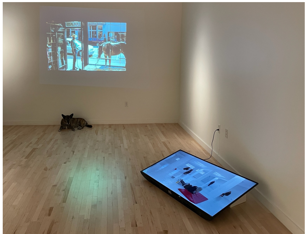
Figure 3. Be Your Dog (floor monitor) and Gus and Deuce Go Elsewhere (wall projection), with Elvira, in the Draw | Breath | Animal exhibition, Tippetts and Eccles Galleries, 2021.

The reviewing of video footage after the fact (such as ongoingly with Be Your Dog , Bartram, and Gus and Deuce Go Elsewhere , Deigaard [Figure 3]) not only teaches and informs us of interactions and animal communications (ears swivelling, body language) that can outpace human perception in real time, but also gives rise to layered and significantly symbiotic artworks and related iterations across disciplines. Bodily engagement and mutual sensory immersion yield insights, reflective and documentary, of acts of companionship shared in (otherwise and normatively human-centric) artistic space. Bartram's Be Your Dog , a documentary video of a dog and human artistic pack formation within Karst, a gallery in Plymouth UK, made collaboratively in 2016, explicitly invokes the engagement of bodies in concert and response, and of the human following the animal's lead towards heightened empathetic access. Deigaard's Gus and Deuce Go Elsewhere invites the curiosities and disproportionate considerations of horses' free entry into a museum, emphasising their crucial autonomy in choosing to enter or not, and their horse-directed explorations of its contents towards their own enjoyment.