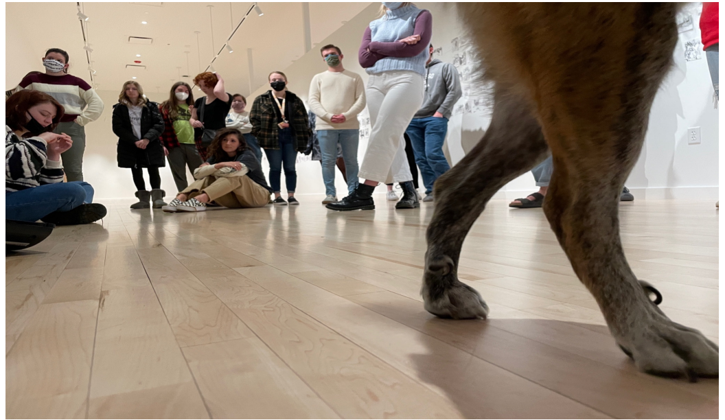
Figure 2. Artists talk with Elvira, in the Draw | Breath | Animal exhibition, Tippetts and Eccles Galleries, 2021.