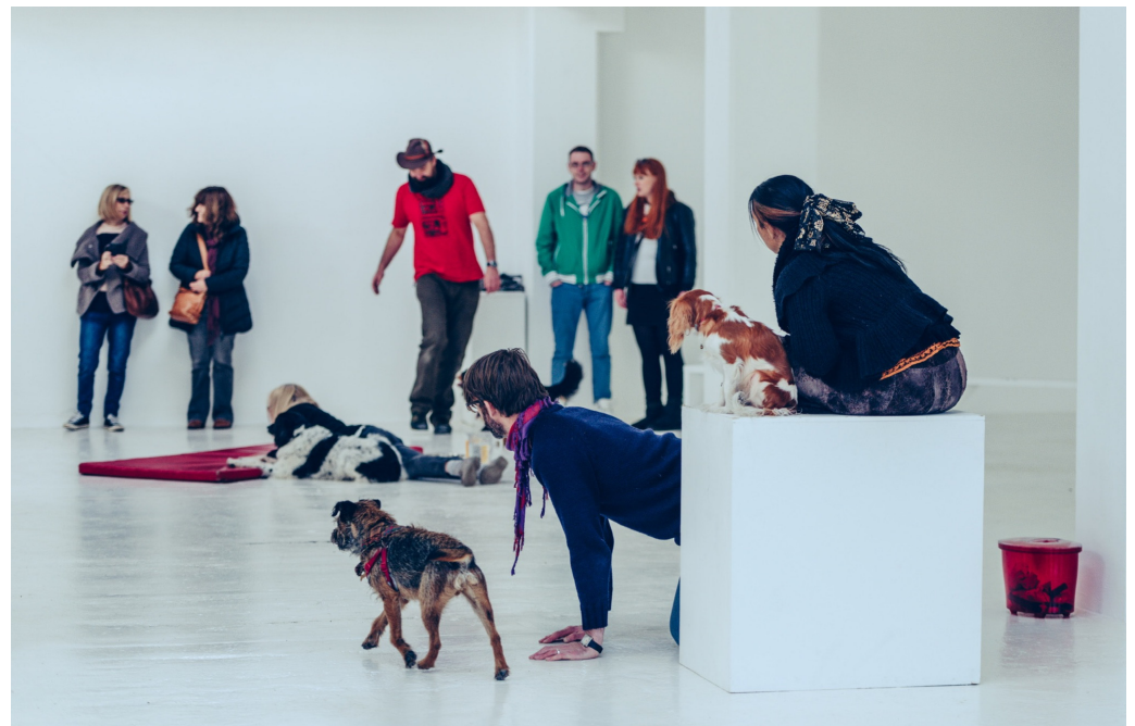
Figure 4. Be Your Dog , public performance, Karst Gallery, 2016.

There is curious and predetermined play within Bartram's Be Your Dog that the artist intends as a positional statement affirming equity, empathy, and creative agency within interspecies dialogues (Figure 4). The public performance, as seen in video footage on the floor-mounted monitor within the Logan exhibition, took place within Karst, the host gallery in Plymouth (UK) in November 2016. Seven pairs of dogs and their humans were selected from an open call to create an interspecies artistic pack. Participants were selected based on the human's descriptions and understandings of empathy within their domestic relationships with their dogs. The invitation to participate did not concern human-centric privilege or gratification, and selection was based on the person's willingness not to be dominant in this context but in service to their dog's experience. The participants did not know each other; they did not know the artist. The selected dogs represented many breeds and sizes and were of mixed gender, as were the humans. All brought their own sensibilities. Two consecutive weekend workshops took place before the eventual public performance.