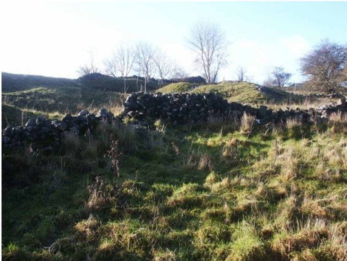
Portobello Mine 2010 A capped shaft is situated on the mounds in the middle-distance, behind the wall

reflecting, with great subtlety and power, the complexity behind an outwardly untroubled landscape provides many insights into how relationships of this kind might be explored. 155