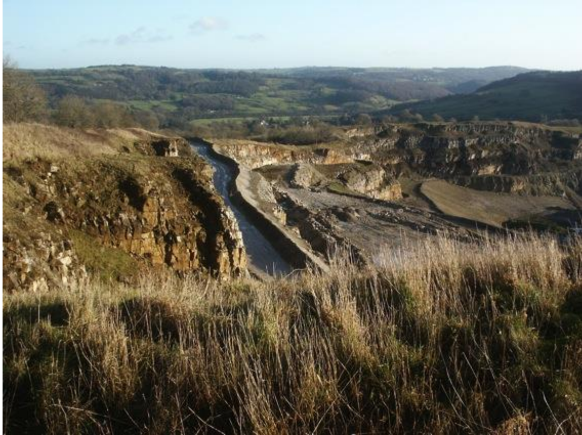
Dene Quarry (2012)