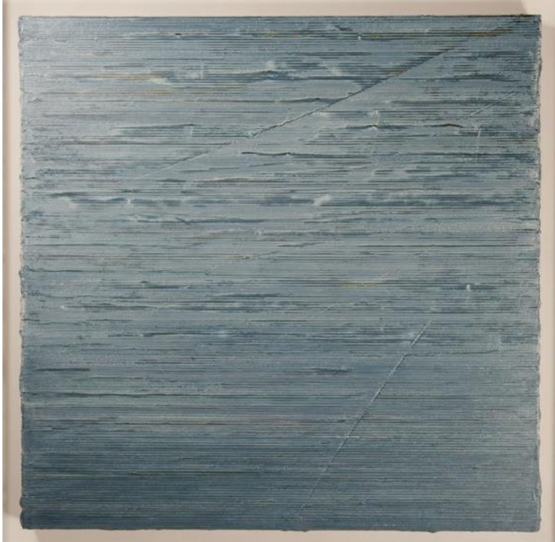
David Ainley Portobello (Veins) 2010-11

In the paintings such as Portobello (Veins) the drawing of the horizontal lines, is undertaken with blades. Each line has a particular character determined by the quality of the blade used (steel varies in its durability), the wear it has had previously, the speed of drawing and the pressure applied, together with the hardness of the paint layer determined by the time it has dried and the addition of specific acrylic mediums. This approach to painting has many analogies with mining through, for example, shared concerns in prospecting, adventuring, and proceeding with a notion of what will be found associated with elements of chance that frustrate or facilitate progress. In this respect the systems approaches adopted in my work in the early '70s have become more open to intuition, responding to a feeling for the work as it proceeds rather as those old miners of William Hooson's ilk did. The idea of 'winning' in mining associated with 'the hard-won image' in painting is appealing. 152