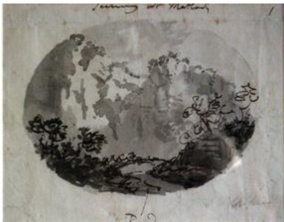
William Gilpin Scenery at Matlock (c.1772)