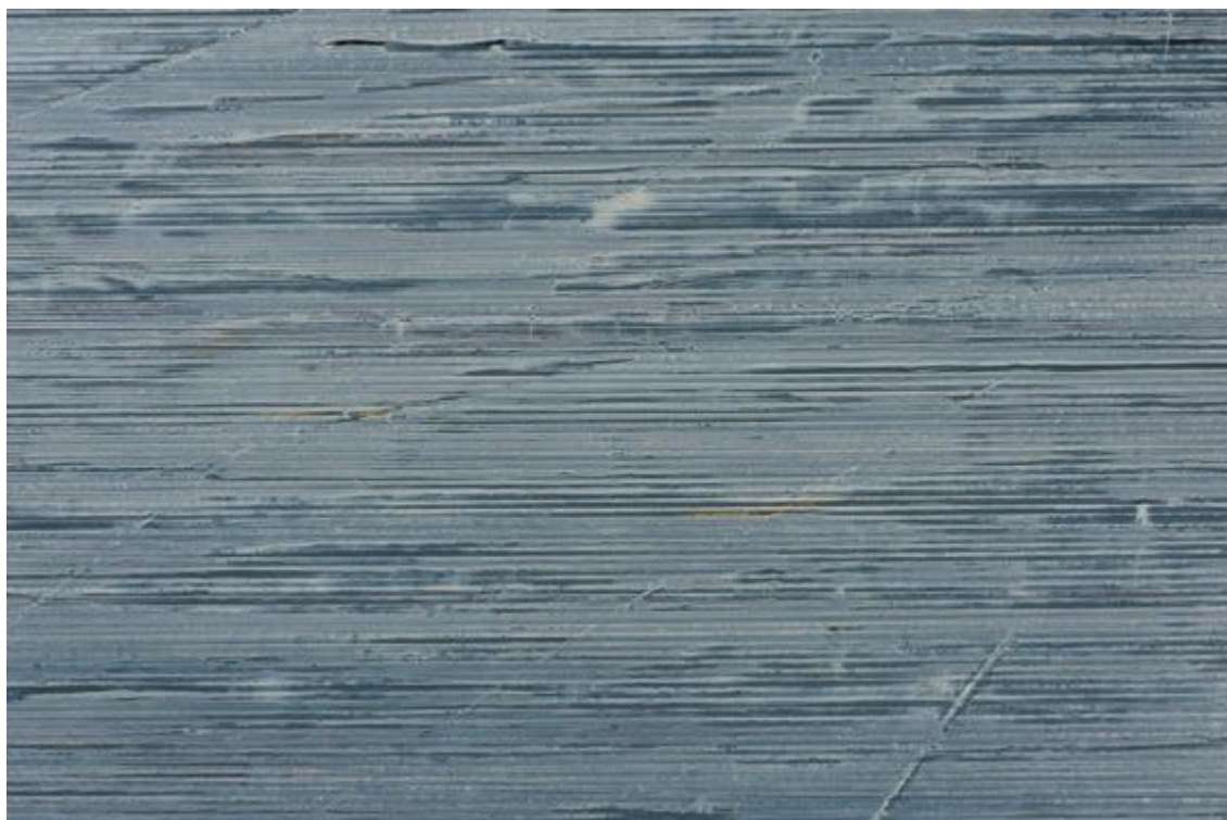
David Ainley Portobello (Veins) Detail

Skep- , a likely root of 'scape', means to cut, to scrape, and even to hack. Landscape possesses the sculpting power of a hapjo , Germanic for 'cutting tool' and a close relative of skep -... Landscape is also what is cut out , the skopo – another Germanic word, one that means 'container', as does Middle Dutch shope , a cousin of English 'scoop'. As cut out from the earth, scraped within its surface, a landscape becomes a container; the scrape is also the scoop. Thus telluric violence gives way to conservation, allowing landscapes to hold and retain things (and memories of things). 153