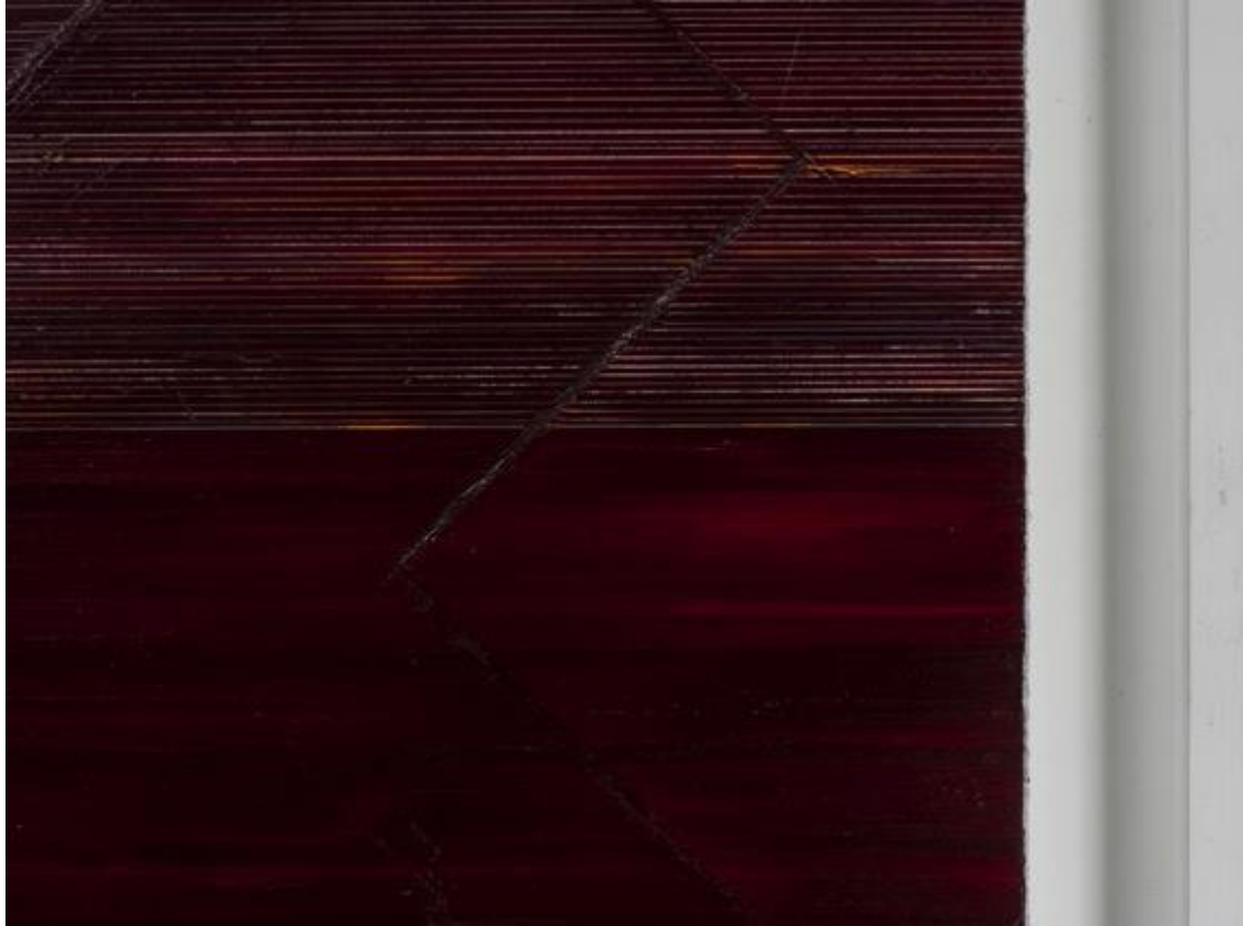
David Ainley A painting in the Landscape Issues series at an early stage showing the edge of the central cross and incised lines

Avoiding the particularity of depicting individuals at their labour, or without foreground, middle distance and horizon lines, I am concerned to engage viewers in the contemplation of landscape as evidence of human endeavor. This is, like the landscape itself, not easy viewing. As landscape paintings they will challenge the expectations that many people have of that genre. Many viewers of landscapes and paintings of landscape, and artists with an excessive concern to make their communication immediately appealing, are regrettably blinded by spectacle. The great French writer and filmmaker Alain Robbe-Grillet explained the situation: