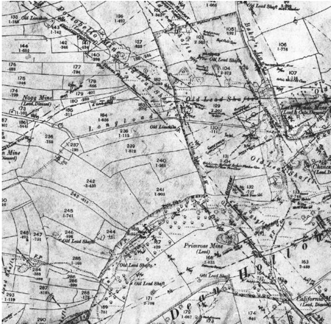
Dean Hollow Barmaster’s Map 1899 Portobello Mine and veins at top left

name as part of its history, and as such due as much respect as any piece of rusted machinery or hole in the ground.” 146