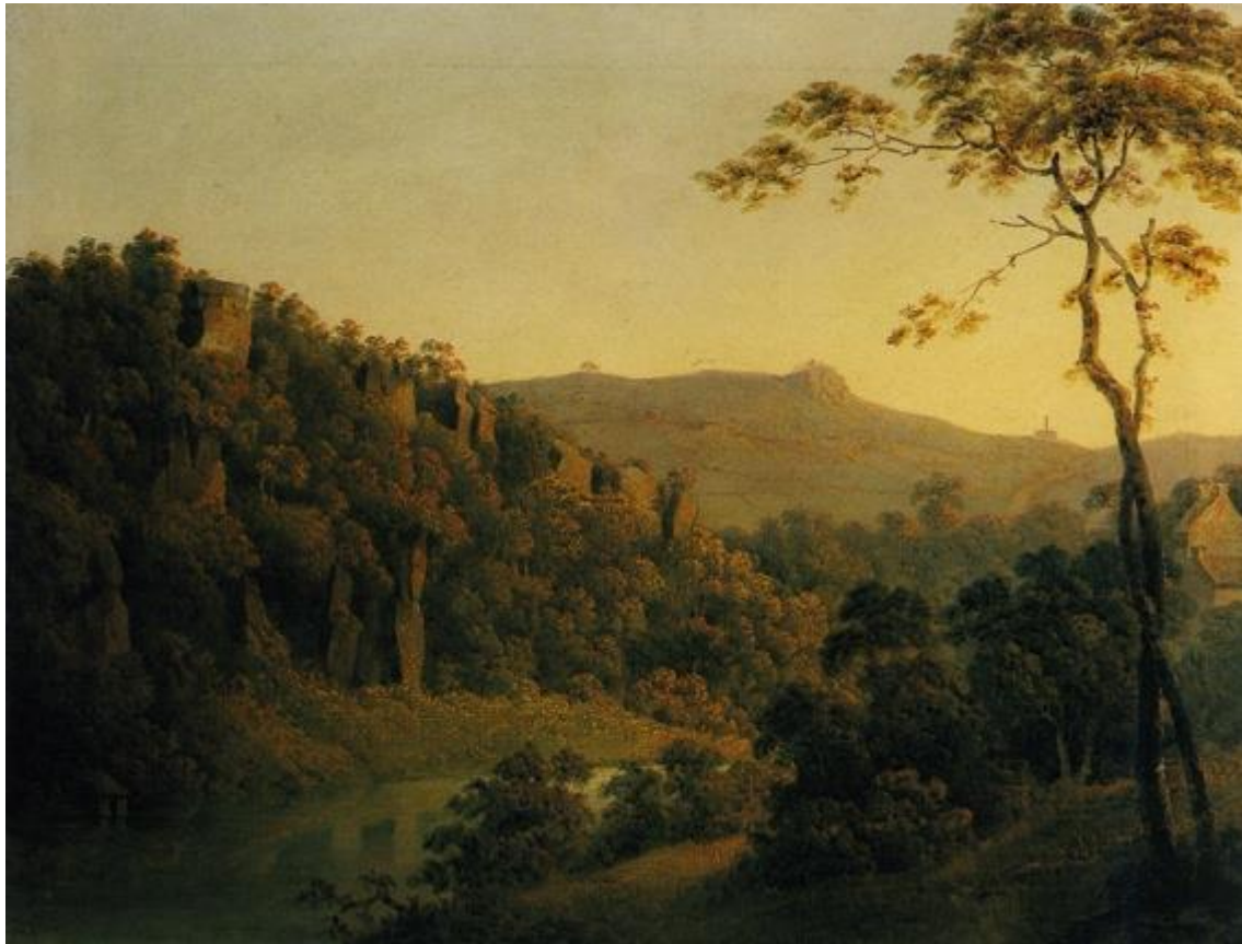
Joseph Wright (Wright of Derby) Matlock Dale, looking towards Black Rock Escarpment (between 1780 and 1785) in the Paul Mellon Collection, Yale Center for British Art