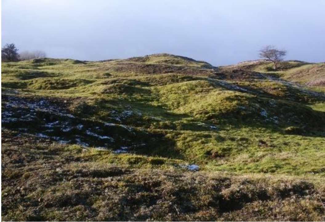
Hillocks and hollows on the Gang Vein (2012)

For many years I walked over the Gang Vein and, rather than following Psalm 121.1 and lifting up my eyes to the hills and regarding the spectacle of High Tor and Cat Tor in Matlock Dale to the North, in the early days of my walks I had to keep my eyes to the ground for fear of falling down one of the many open mineshafts. Drops, sometimes of hundreds of feet, were sometimes concealed by only a few twigs overgrown by grass. Most, but not all, of the shafts in the area have now been capped, but walkers should still be wary. I dropped stones down these abandoned shafts, as the 12-year old Auden had done in Weardale, when he had a civilizing and creative epiphany that awakened his poetic sensibility: