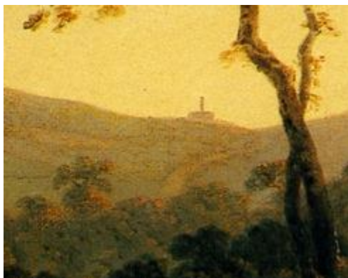
Joseph Wright (Wright of Derby) Matlock Dale, looking towards Black Rock Escarpment Detail of industrial chimney and the top of Cromford Hill