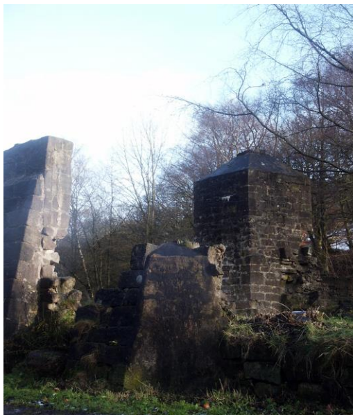
The remains of buildings at the Cromford Moor Mine, near Black Rocks, including the chimney

A spoil heap of the Cromford Moor Mine is between and beyond the trees on the right